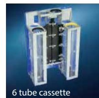
6 tube cassette