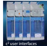
c 2 user interfaces