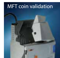
MFT coin validation